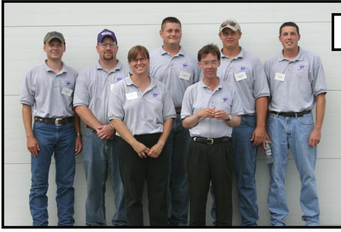
Kansas State University