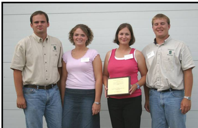
2 nd Place Michigan State University