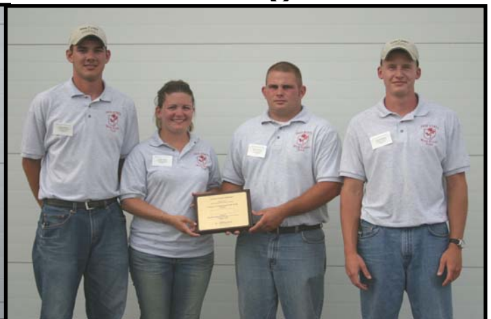
1 st Place Ohio State University