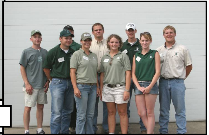
Michigan State University