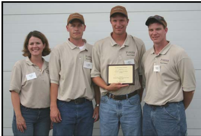
1 st Place Purdue University