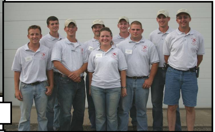
Ohio State University