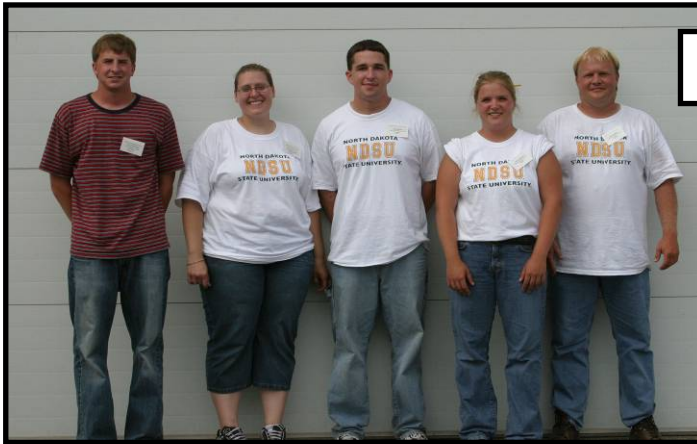
North Dakota State University