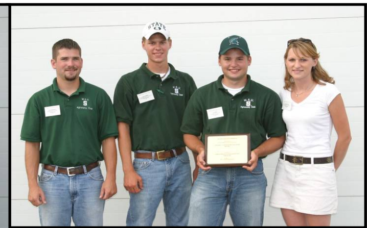
2 nd Place Michigan State University