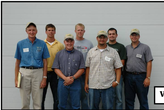
Western Illinois University