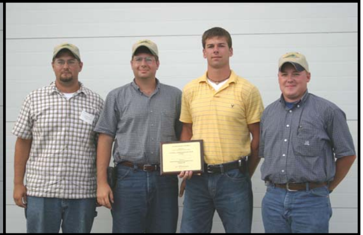
3 rd Place Western Illinois University