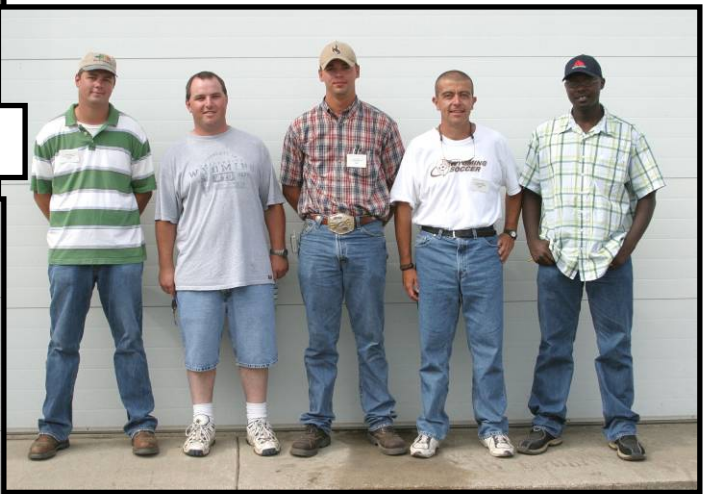
University of Wyoming