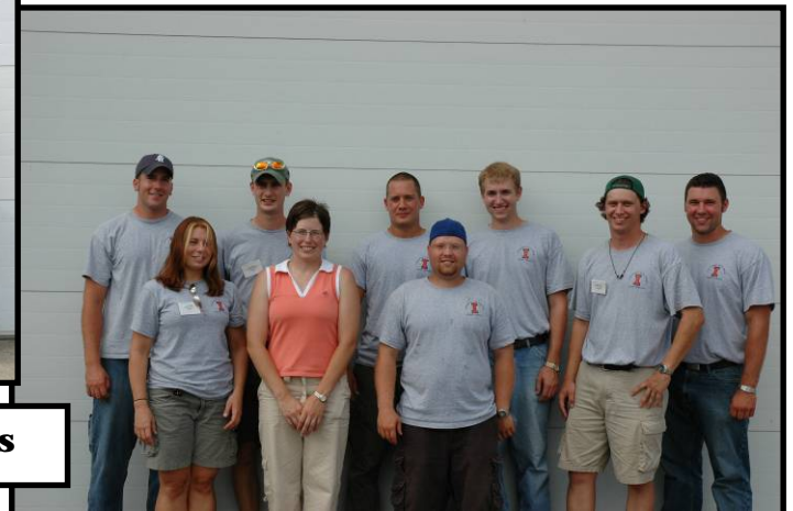
University of Illinois