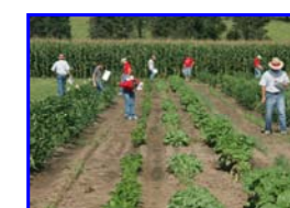
1st Summer Contest 1981 Photo of 2005 Contestants At Kansas State University