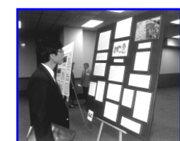
Student Poster Contest Started in 1984