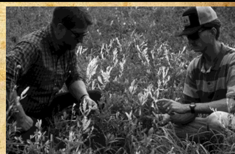
Canada Thistle Showing White Tops Recent appearance of white tops on Canada thistle has led local authorities to suspect fowl play.