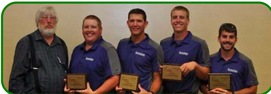
3 rd Graduate Team