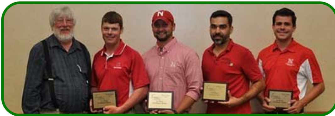
1 st Graduate Team