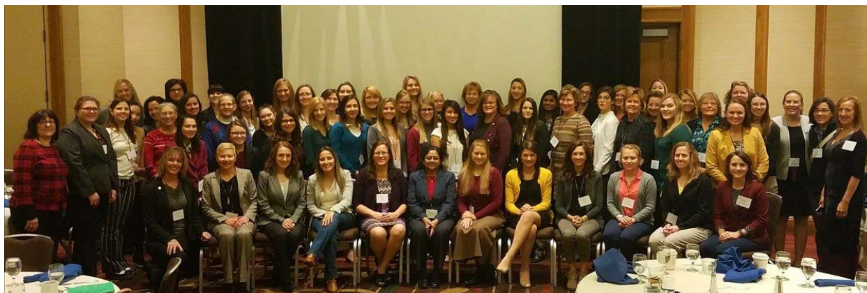
The Women in Weed Science at the annual meeting in St. Louis, MO on December 6, 2017