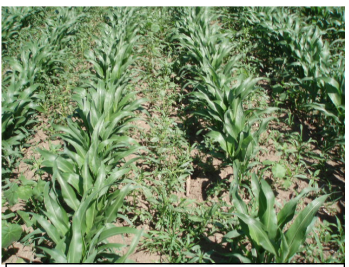
Undergraduate Problem: Poor Control in Sorghum

Cause: The herbicide ran out of "gas" and no longer could control emerging weeds. Recommendation: The farmer could use a post herbicide product such as Paramount + atrazine either by itself or in combination with cultivation.