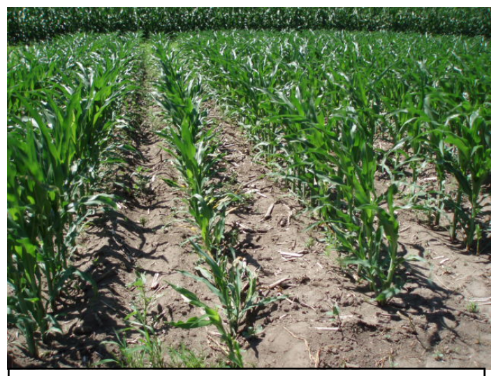
Graduate Problem: Interaction of Steadfast and Counter

Recommendation : Corn plants may grow out of injury but will probably have some yield reduction. Next year the farmer needs to make sure no OP insecticide is applied where he wants to use an SU herbicide. To control the pigweeds he should come back with a post product that is non-ALS or could use cultivation.