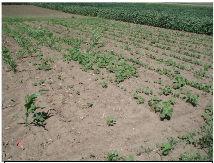
Graduate Problem Finalist Round: Spartan Carryover in Sugarbeets

Recommendation: Farmer should leave field as is but will realize a yield loss and he needs to control the emerged weeds. Next time he needs to be more aware of rotation restrictions when planting sugarbeets.