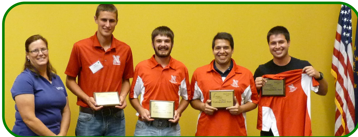
3rd Undergraduate Team University of Nebraska