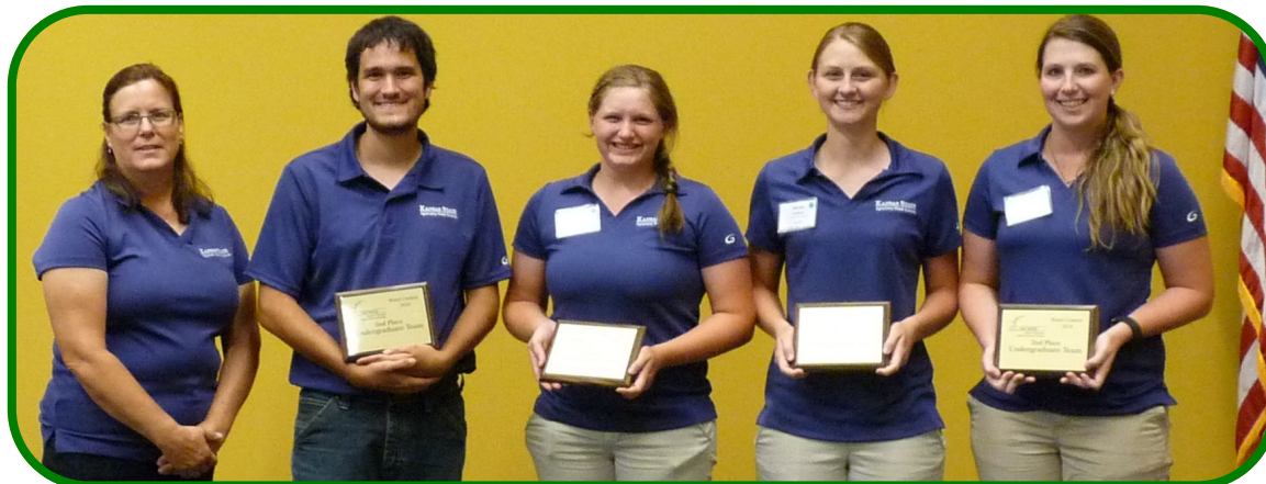
2nd Undergraduate Team Kansas State University 1st Team Calibration