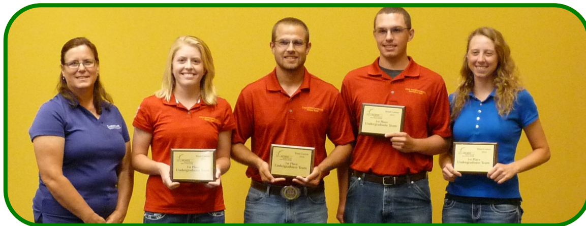
1st Undergraduate Team Iowa State University